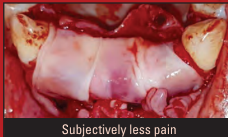
Subjectively less pain